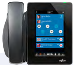
Digium D80 Touchscreen Executive

Ideal for executives, conference rooms, reception, and more.