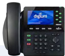
Digium D65 Feature-Rich High-End

Ideal for managers, call queue agents, reception, and more.