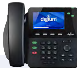
Digium D62/D60 Standard Feature

Ideal for all phone users, common areas, hallways, break rooms, and more.